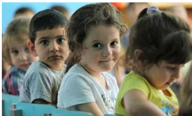
Children in kindergarten, Yerevan, Armenia

Building on the success of this pioneer project, the EIB with the support of the EU, is already planning two new similar operations to further improve energy efficiency in Armenia.