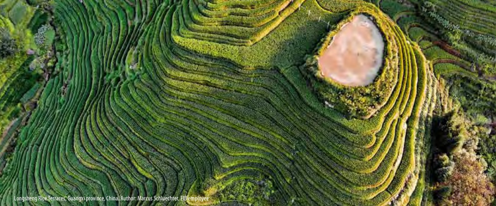
Longsheng Rice Terraces, Guangxi province, China.