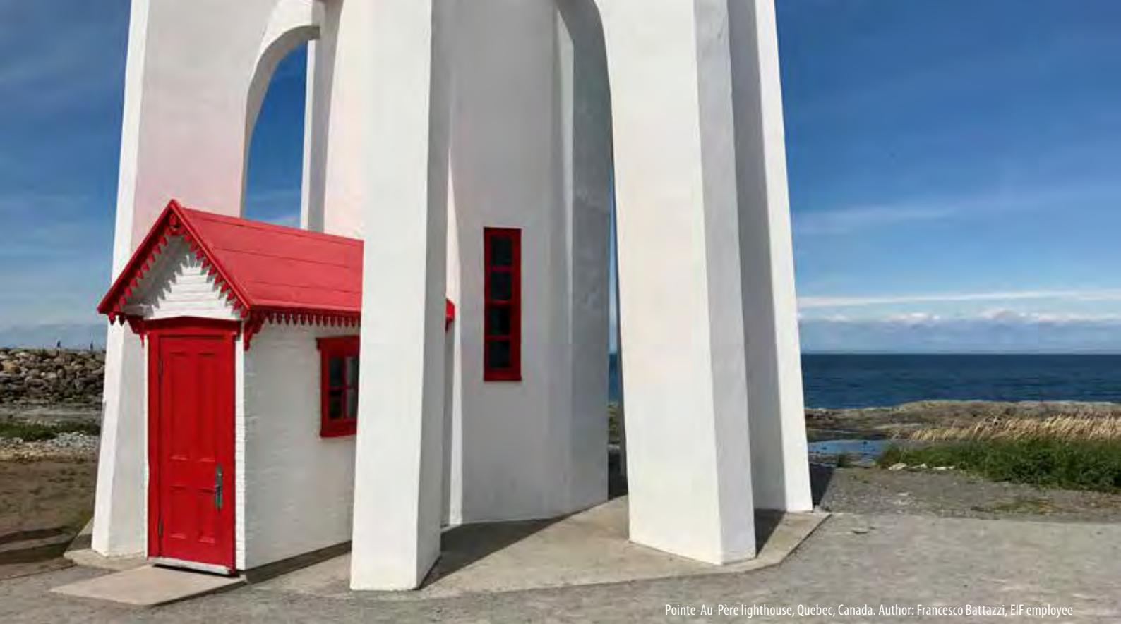
Pointe-Au-Père lighthouse, Quebec, Canada.