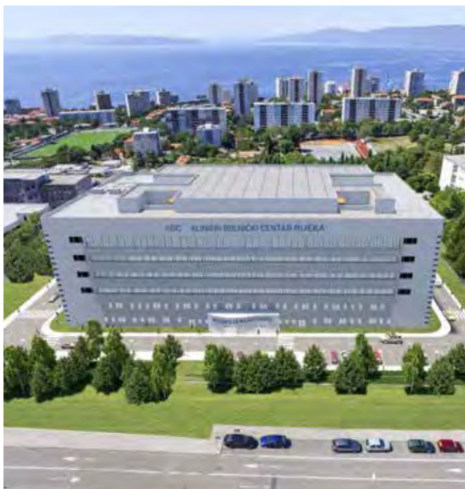
Rijeka Clinical Hospital: an example of the Advisory Hub's activity in Croatia