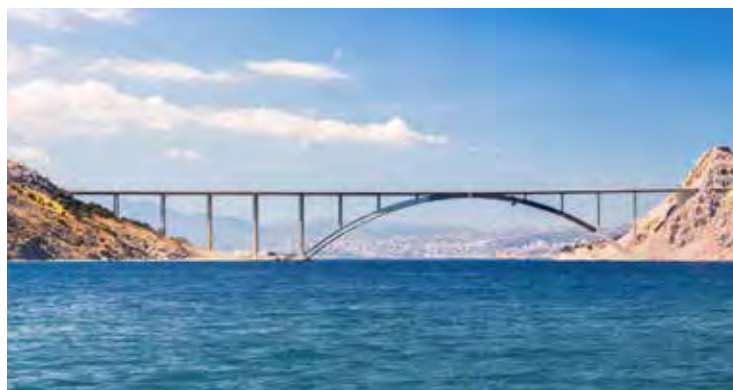
Krk Island, Croatia

The project consists of the construction of sewers and marine outlets, reconstruction of coastal collectors (collectors of seaward groundwater flow) and construction of secondary biological wastewater treatment plants in the six localities on the island, as well as the rehabilitation of the water supply network in routing parallel to the new sewers. The works will negatively impact the environment in the short term, as construction involves demolition, excavation, erection and rehabilitation works. Once completed, however, the environmental impact of the project is expected to be very positive as it will stop the discharge of pretreated sewage into the Adriatic Sea. Besides the job opportunities created during implementation, the social impact of the project is also expected to be positive, since the new technologies will improve public health – in addition to keeping the sea and beaches clean for tourists.