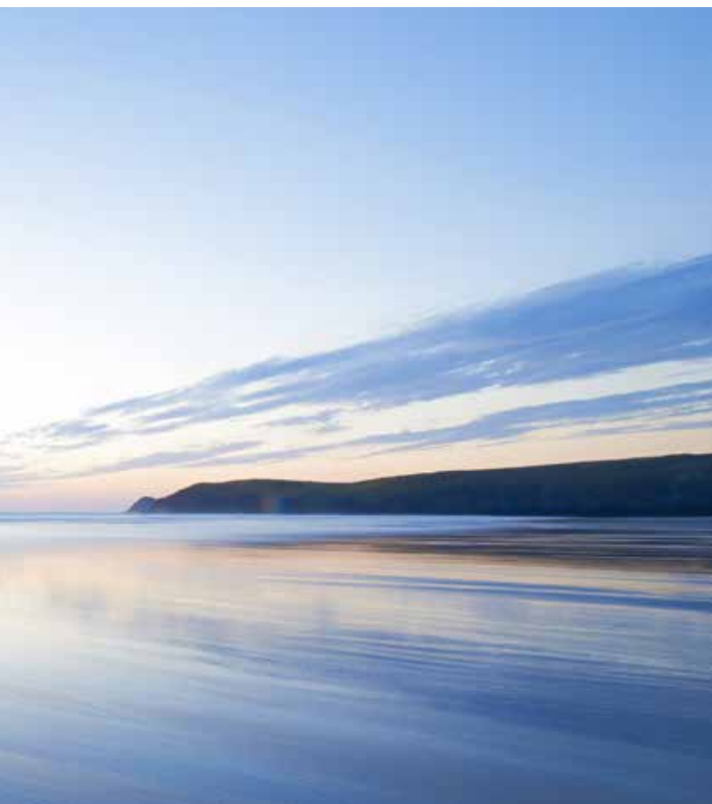
Waterview at dusk, United Kingdom