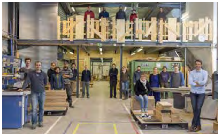
French furniture maker La Fabrique