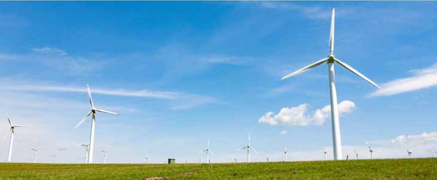
Wind power station on a blue sky day