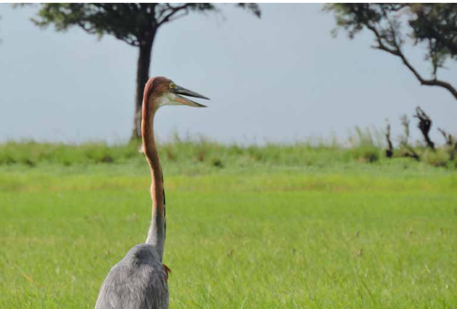
Goliath Heron in Okavango Delta, Botswana.