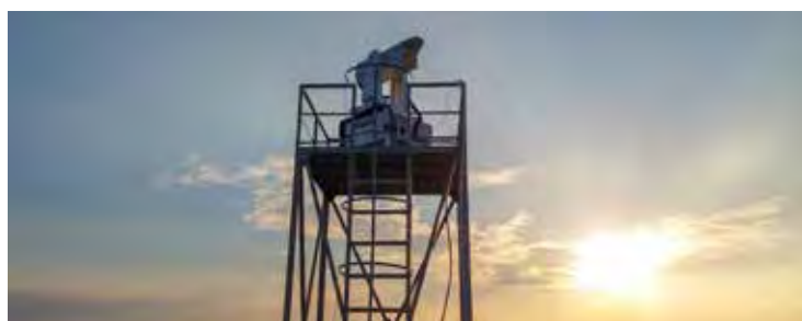
Raymetrics LIDAR technology

In addition to our activities in the European Union, the EIB supports EU policy objectives through investment in some 130 external partner countries. Following the mid-term review of the External Lending Mandate (which governs the majority of EIB activity outside the EU), the €27 billion mandate for 2014-2020 has been increased to €32 billion. It covers pre-accession countries and beneficiaries, Neighbourhood and Partnership countries, Asia and Latin America and South Africa, focusing on private sector development, social and economic infrastructure, climate action and economic resilience.