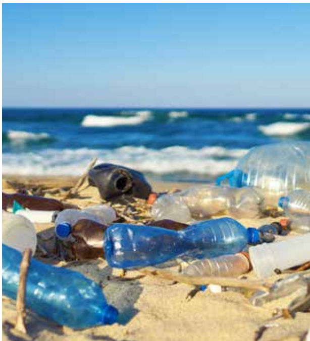
Plastic waste on a beach, Black Sea

Another high-profile project is the €30 million loan agreement with the French mid-cap Amadéite Group, a pioneer in the field of marine biotechnology, which develops solutions to limit the proliferation of algae and reduce the use of synthetic pesticides, fertilisers and antibiotics.