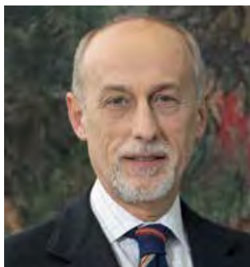
Pier Luigi Gilibert EIF Chief Executive

S ustainable finance is in the DNA of the European Investment Bank Group and underpins our activities. Quoting the Treaty on European Union: “The Union's aim is to promote peace, its values and the well-being of its peoples (...) It shall work for the sustainable development of Europe based on balanced economic growth.” Our task is to translate the Treaty into practice by contributing to the balanced and steady development of the EU.