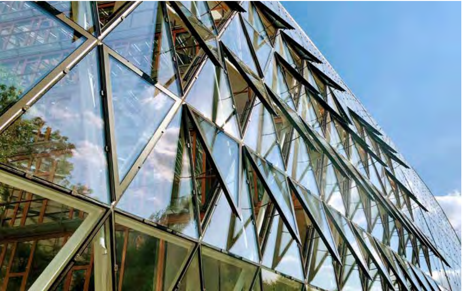
EIB/EKI building.

The European Investment Fund specialises in risk finance to benefit micro, small and medium-sized enterprises (SMEs) and stimulates growth and innovation across Europe. It provides financing and expertise for sound, sustainable investment and guarantee operations. EIF shareholders include the EIB, the European Commission, and a wide range of public and private banks and financial institutions. By developing and offering targeted products to its financial intermediaries, such as banks, guarantee and leasing institutions, micro-credit providers and private equity funds, the EIF enhances access to finance for SMEs. ✓