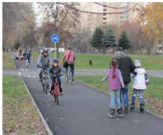
Cycle routes, Lviv, Ukraine

Other cities in Ukraine plan similar improvements. The road safety works will cost €177 million, which will be funded by a low-interest rate framework loan supported by the EIB. The investment will pay for new urban traffic infrastructure to improve road safety for drivers as well as for the most vulnerable road users, pedestrians and cyclists.