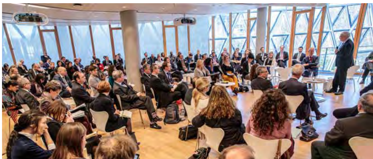
2018 EIB Civil Society Board seminar

The third tier is at the level of financed operations. Standard 10 of the EIB Environmental and Social Standards and Principles requires our promoters to maintain an open, transparent and accountable dialogue with all relevant stakeholders in an effective and appropriate manner. This standard stresses the value of public participation in the decision-making process throughout the preparation, implementation and monitoring phases of a project. Under the EIB's Standard 10, stakeholder engagement is defined as embracing a broad scope of compliance requirements for our promoters relating to (a) disclosure and dissemination of information linked to the EIB-financed operation, (b) the undertaking of public consultations and meaningful stakeholder participation, and (c) a mechanism ensuring access to grievance redress and remedy. All such activity should be guided by the principles of free, prior and informed engagement, with the aim of achieving broad support from the affected communities and longer-term sustainability for operational activities.