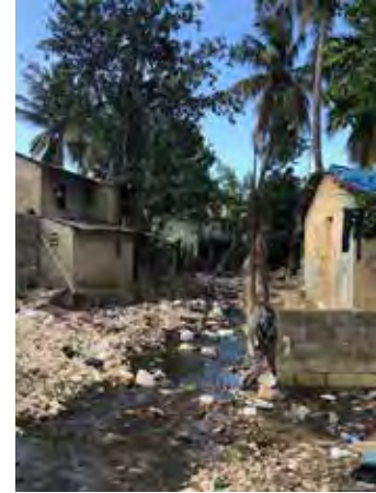
Damage from Hurricane Matthew, Dominican Republic