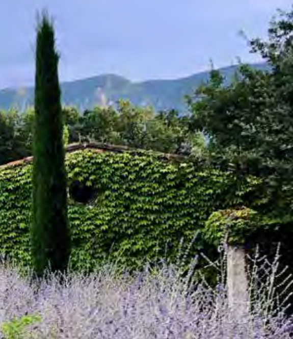
Lavender garden in Provence, France.