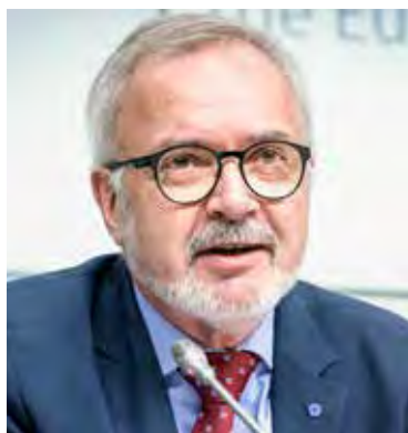
Werner Hoyer EIB President