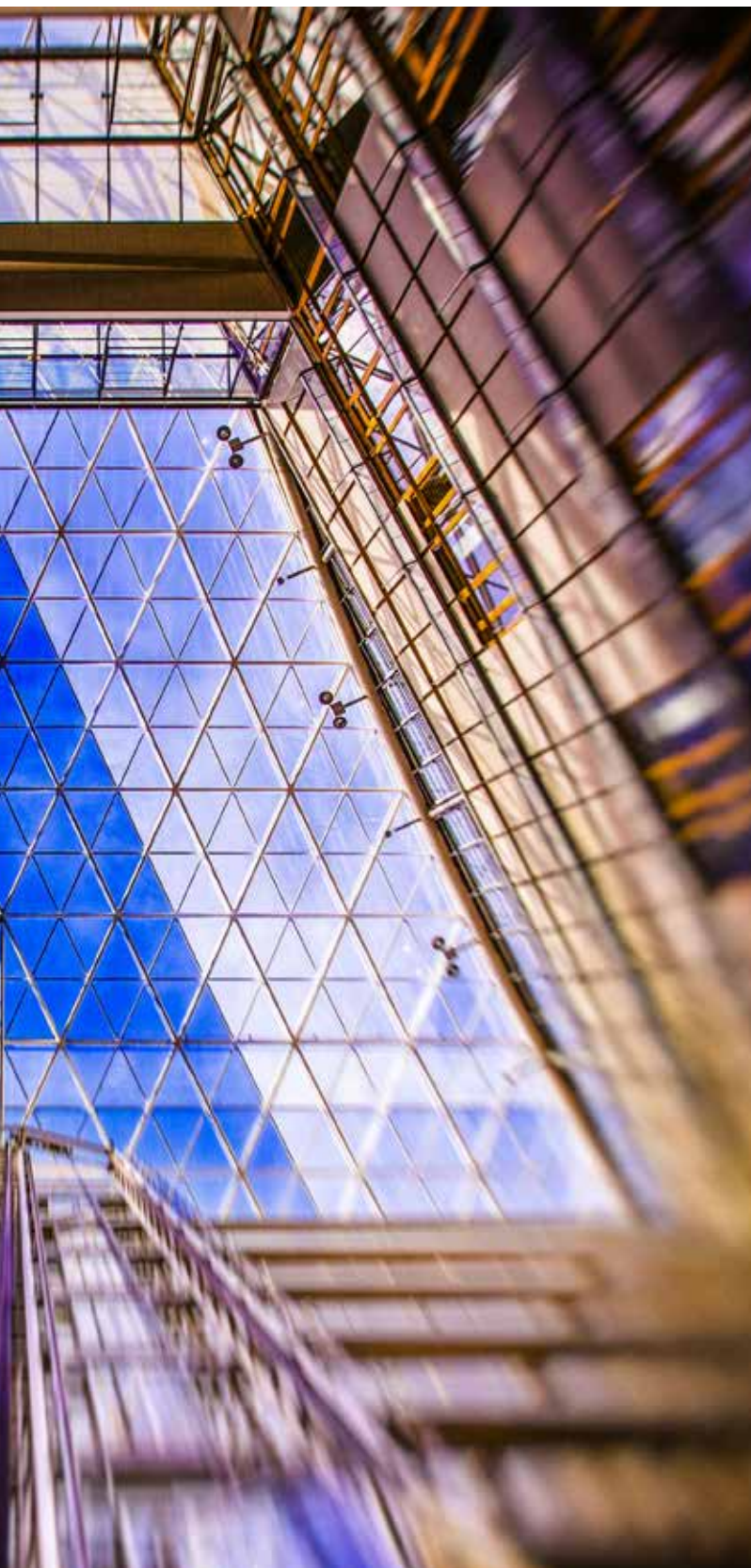
Elevators in the EIB EKI building.