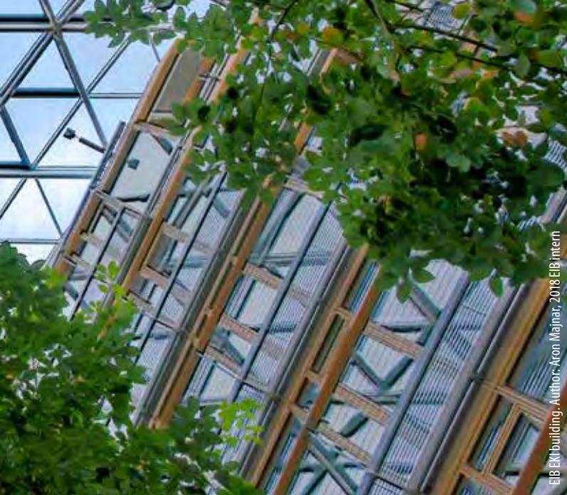
EIB EKV building.

and monuments with a large network of members and associated organisations in nearly 50 countries. This innovative cooperation mixes the cultural expertise and lobbying work of Europa Nostra with the technical appraisal and rescue planning skills of the EIB. Based on applications submitted by local NGOs, both organisations regularly select seven priority sites. The EIB experts carry out on-site missions and produce technical reports on the viability and phasing of the project as well as on the funding options. The initiative covers all regions in Europe and not only the EU.