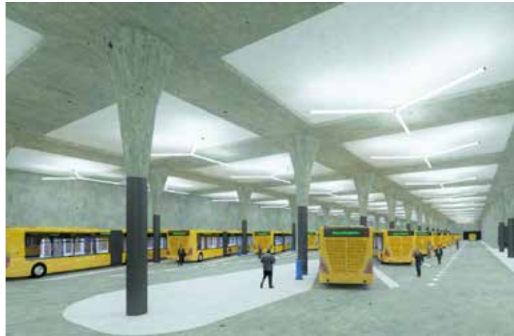
Modernisation of Warsaw's transport system