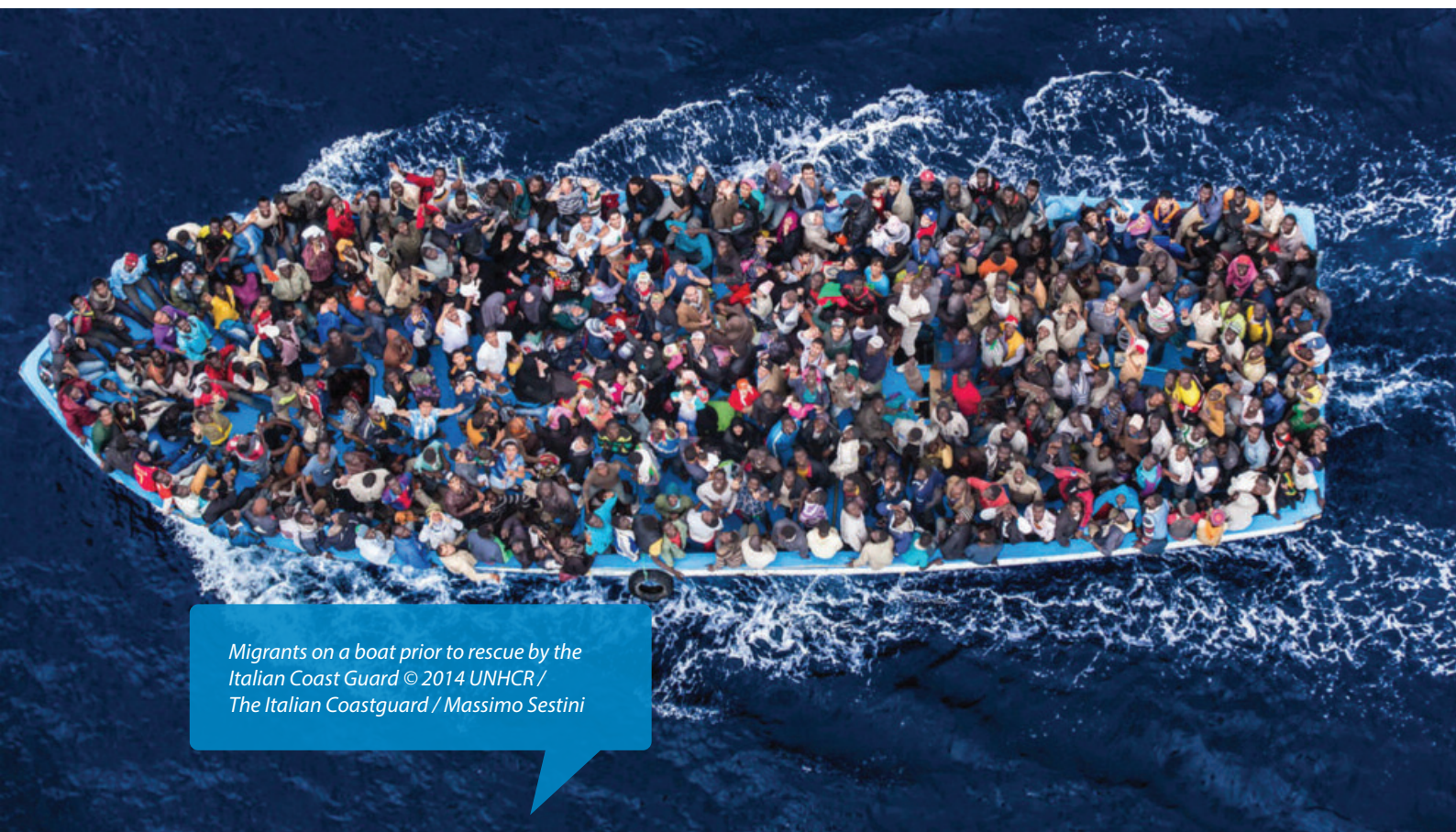
Migrants on a boat prior to rescue by the Italian Coast Guard

Furthermore, both rapid onset and slow onset climate stresses are also leading to displacement and population movement. Rapid onset disasters such as floods, storms, earthquakes, volcanic eruptions and wildfires have led to 24.2 million people being newly displaced in 2016 2 . In addition, slow onset climate stress caused by rising sea level, increasing drought, or accelerating desertification can also drive displacement when combined with economic, social and political factors. While it is conceptually and practically difficult to establish a precise category of environmental or climate migrant, the Nansen Initiative Platform on Disaster Displacement 3 is seeking to find ways to address the needs of these groups of migrants.