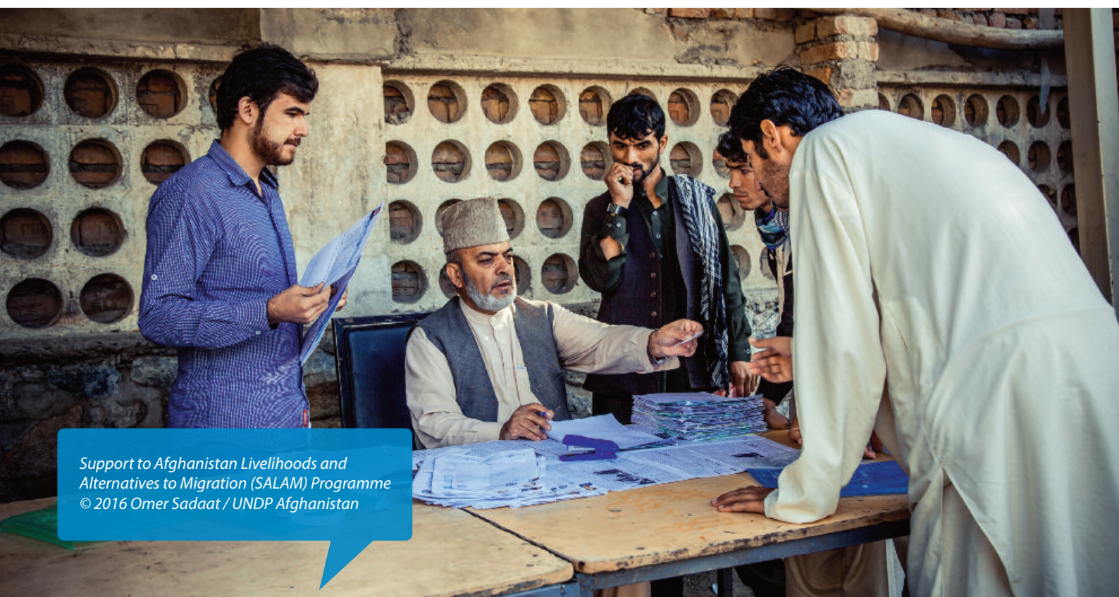
Support to Afghanistan Livelihoods and Alternatives to Migration (SALAM) Programme