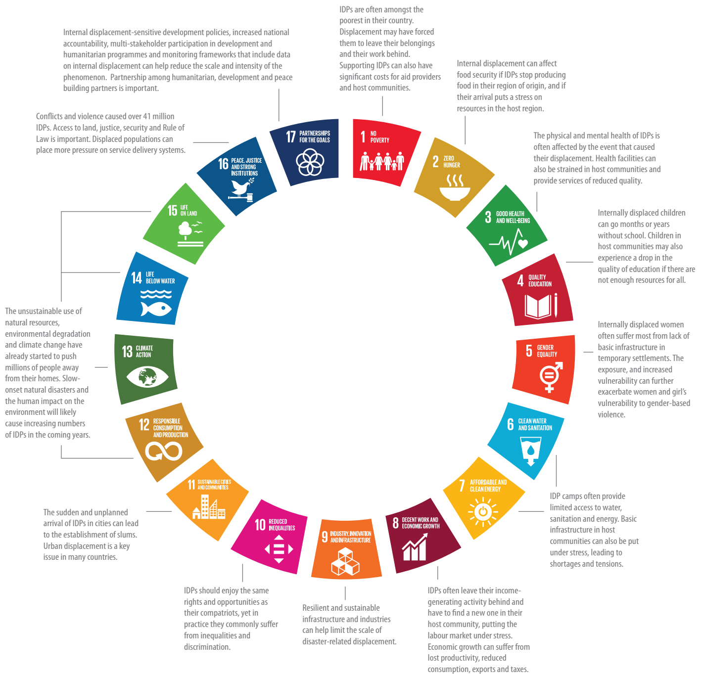
Figure 2 | Relevance of each Sustainable Development Goal to internal displacement and vice versa 7

In line with the UNDP Strategic Plan 2018-2021, by focusing on the four specific areas (see page 4), UNDP helps countries to achieve sustainable development by eradicating poverty in all its forms and dimensions, accelerating structural transformations for sustainable development, and building resilience to crises and shocks. Among others, our comparative advantages lie in ensuring that migrants, refugees and IDPs are included in our programmes on poverty reduction (SDG 1), Decent work and economic growth (SDG 8), addressing inequalities (SDG 10), climate change (SDG 13), peace and justice strong institutions (SDG 16), and building partnerships for the SDGs (SDG 17) (see Table 1 and Figure 2 for more on SDG linkages).