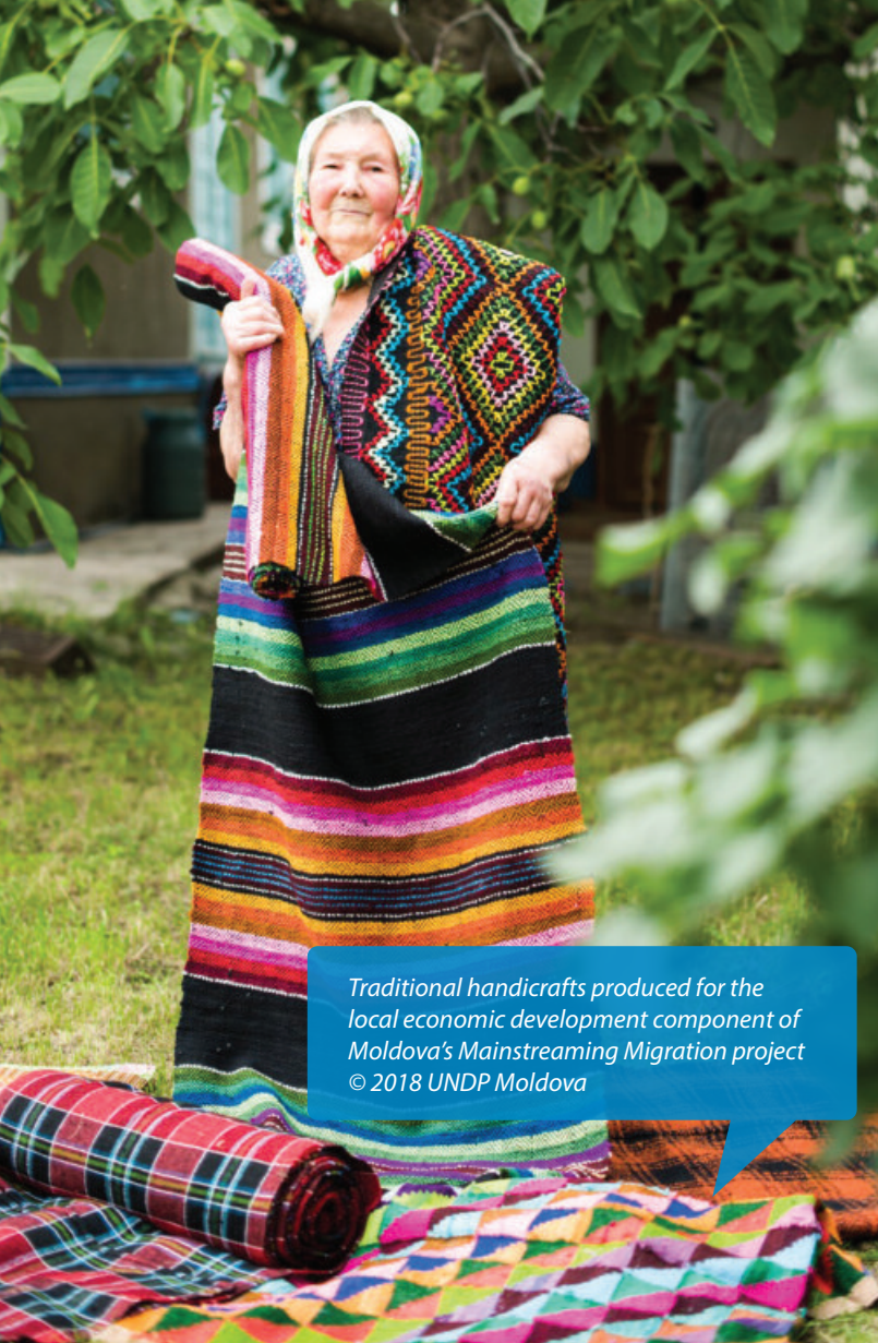
Traditional handicrafts produced for the local economic development component of Moldova's Mainstreaming Migration project