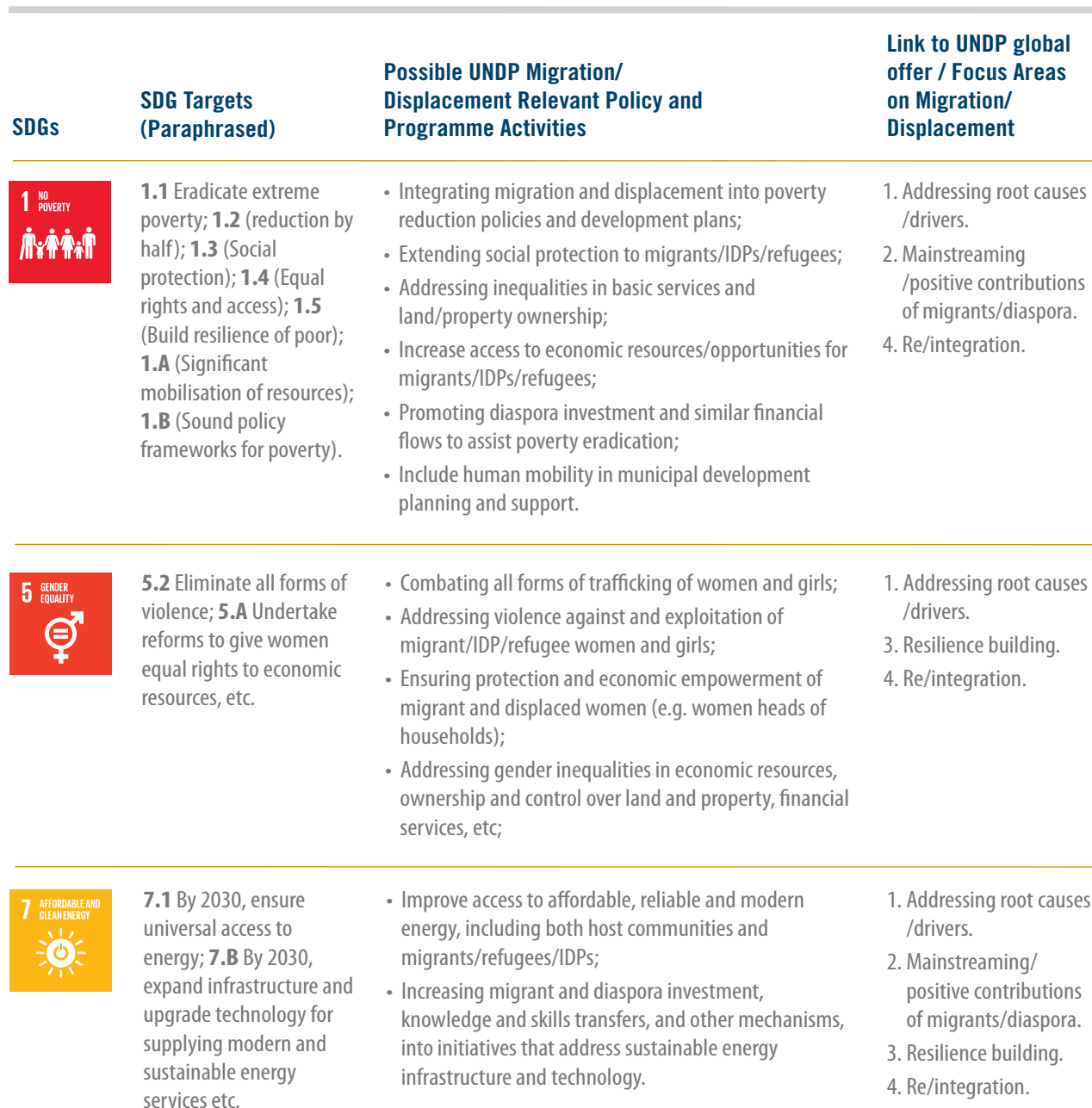
Table 1 | SDGs and Indicative UNDP’s Migration and Displacement Policy and Programming

conventions, 4 e.g. the 1951 Refugee Convention and its 1967 Protocol and related Regional Conventions, International Convention on the Protection of the Rights of All Migrant Workers and Members of Their Families, and guiding principles such as the Guiding Principles for Internally Displaced Persons, among others. UNDP supports member states in their commitment to protecting the safety, dignity, human rights and fundamental freedoms of all migrants at all times, regardless of their migratory status.