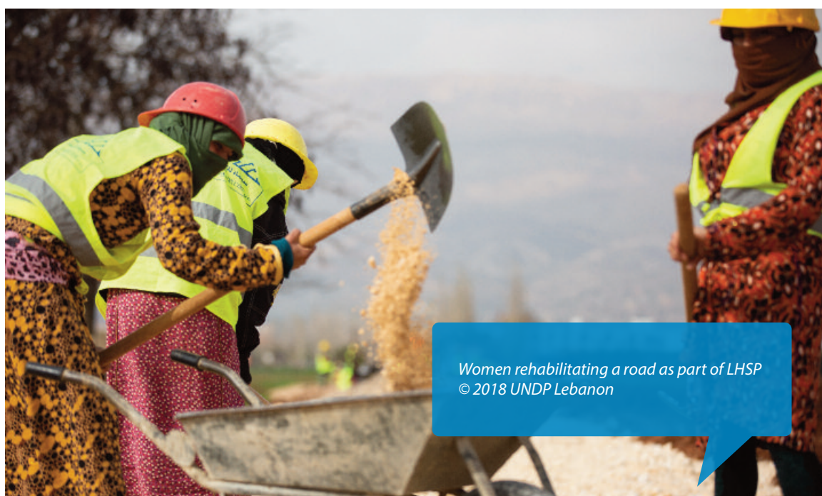
Women rehabilitating a road as part of LHSP

In Burundi , UNDP supported the return of IDPs and refugees between 2012-2013 through community-based reintegration. This included cash for work activities, creating more than 600,000 working days for over 9,000 participants (43% of whom were women); along with social cohesion measures through dialogue and conflict mitigation. Eighty-eight per cent of the cash-for-work participants chose to invest their individual savings into joint economic initiatives, secured a sustainable income and became financially self-reliant; and almost 2,200 beneficiaries (60% of which are women) set up their own small and medium enterprises.